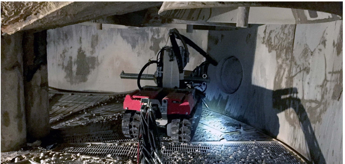
With one of their pieces of Aquajet equipment — an Aqua Cutter 410A — Water Blasting & Vacuum Services saw an 80% increase in efficiency, taking a routine scrubber cleaning application from a 30-hour process to just five.

Strict environmental controls also limited contractors’ application choices. The project partners, known as the Keeyask Hydropower Limited Partnership — which includes four Manitoba First Nations and Manitoba Hydro — had made