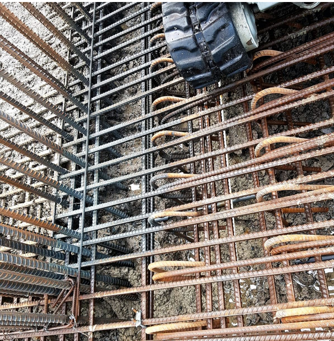
Crews with handheld breakers or excavators could remove the poor-quality concrete, but only by destroying the rebar. Asia Waterjet Equipment knew Hydrodemolition was the only process with the precision and productivity to keep the project on track.

access the site from the Mactan Channel. Proximity to the water and the frequent, heavy rains of monsoon season made ground conditions difficult. However, since the Aqua Cutter is self-propelled with tracks, the uneven, muddy terrain presented no problems for Asia Waterjet Equipment. This minimized necessary site preparations and helped accelerate repairs.