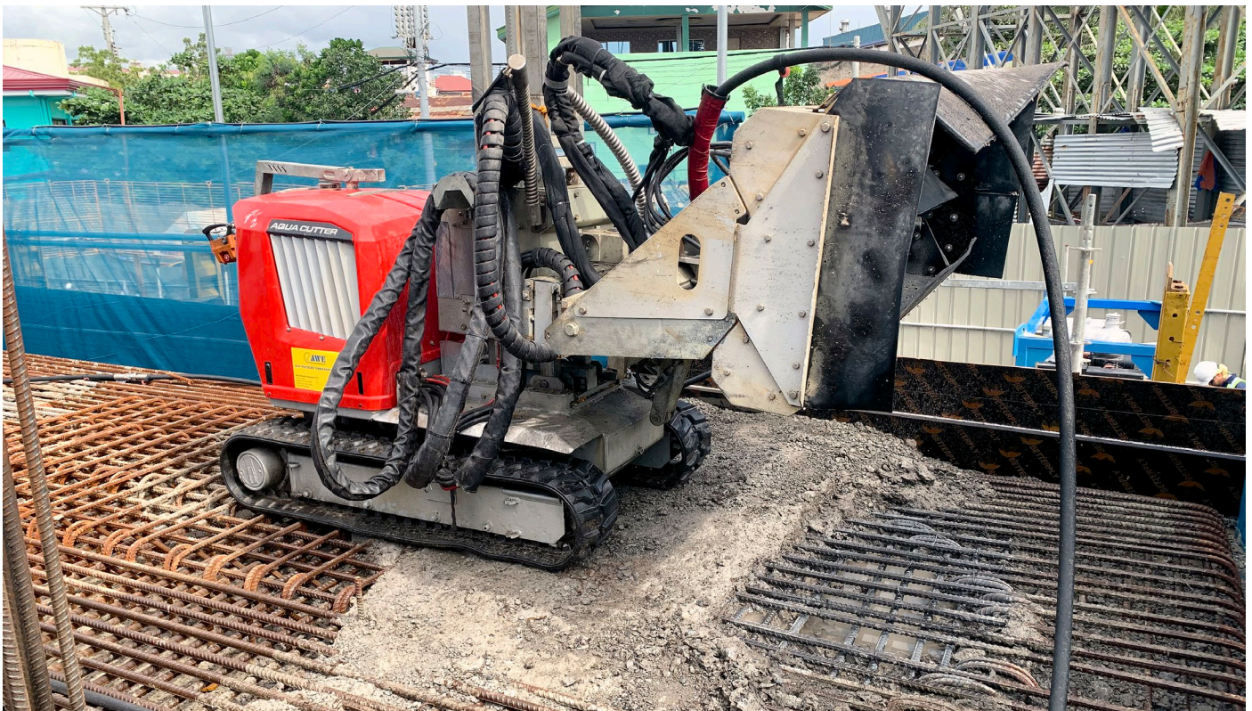
To protect rebar and the existing good concrete, Asia Waterjet Equipment knew Hydrodemolition was the only solution. The non-intrusive method uses high-pressure water jets as powerful as 40,000 psi manipulated by an automated robot to remove layers of deteriorated and damaged concrete.

Crews knew there was a problem immediately. The concrete was already set-