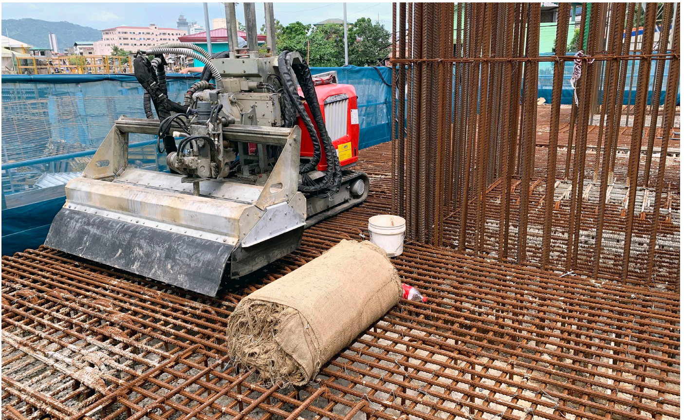
When a bad batch of concrete threatened to derail progress on a major bridge project in the Philippines, Asia Waterjet Equipment turned to Aquajet for a creative solution that could quickly remove the poor-quality concrete without damaging the rebar or putting the project behind schedule.

In the early 1990s, Asia Waterjet Equipment's founders were part of the brave