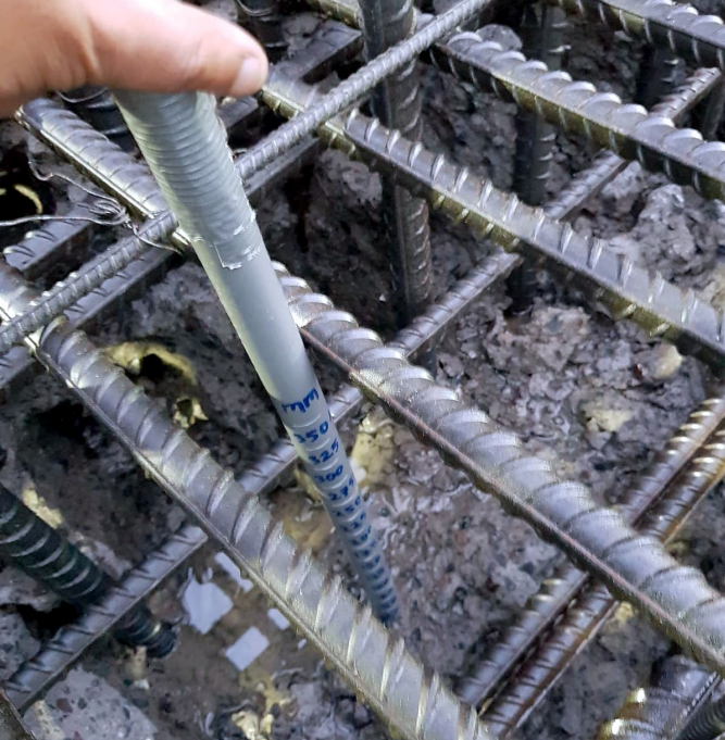
Using the Hydrodemolition robot, operating at 1,000 bar (15,000 psi), and two employees, Asia Waterjet Equipment removed 10 cubic meters (13 cubic yards) of poor-quality concrete at a depth of 150-250 millimeters (6-10 inches).