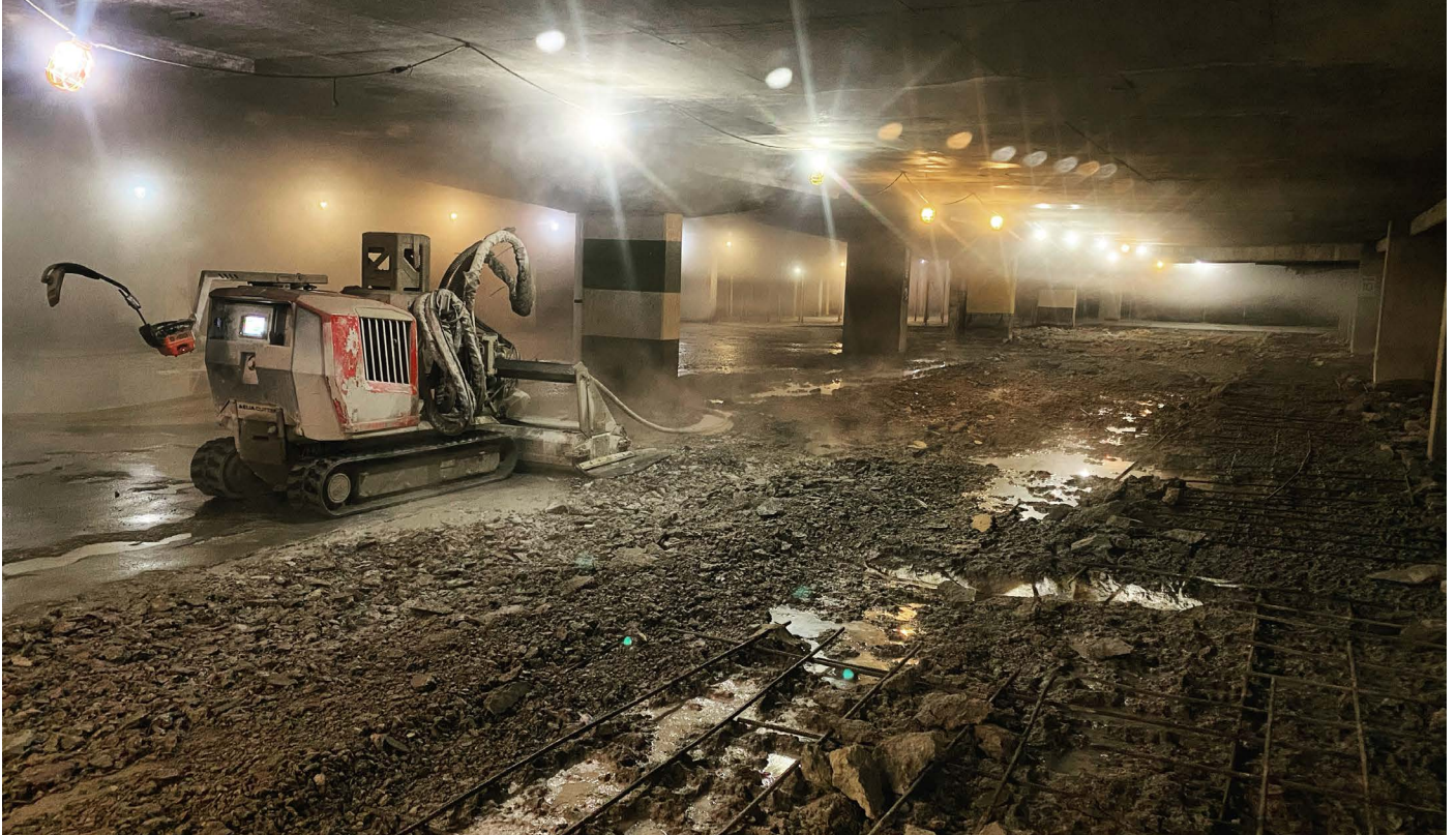
Conterra Restoration and a suite of Aquajet Hydrodemolition equipment provided an eco-friendly solution during a multi-year, multi-million dollar parking garage renovation in Toronto's East End.

molition allowed the contractor to work through the day without disrupting building tenants or the neighboring properties, while at the same time removing large amounts of concrete. The process works extremely well with the added bonus that it doesn't physically damage the remaining concrete left in place compared to traditional jackhammering operations."