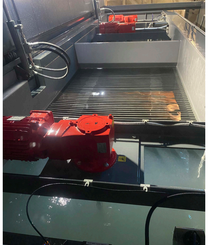
With the EcoClear, Conterra can reduce blast water pH from 12.5 to between 7.5 and 8.5 and suspended solids to 50ppm or less.

“Hydrodemolition put us on the cutting edge of industry trends,” Porciello said. “No one saw a global pandemic coming, but with Hydrodemolition robots, we’ve been able to adapt quickly. This speaks to how manufacturers like Aquajet listen to their customers and plan for the future of construction. From eco-friendly solutions to eliminating silica dust to reducing health risks like white fingers and hearing loss, smart equipment developments keep us ahead of the curve.”