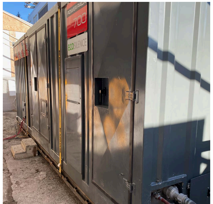
Conterra set up a staging area outside the parkade for the Ecosilence and EcoClear. Depending on the day, the Aqua Cutter robot could be up to 615 feet (187 meters) away and several stories above the pump system.